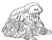
orangutan (a great ape)