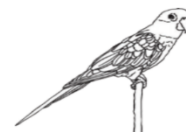
sun conure (a parrot)